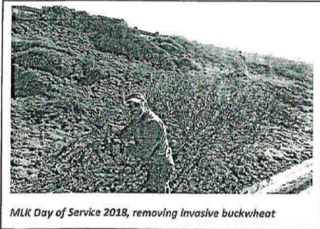
MLK Day of Service 2018, removing invasive buckwheat