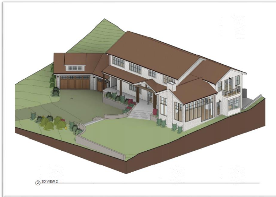
(Clip from Sheet A0.1 of 2021-1105 Plan Set)

The applicant has provided a biological report, preliminary jurisdictional wetlands delineation, and arborist report to evaluate the biological resources and hydrology on the site. Application materials can be viewed at the following link: https://cityofpacific.egnyte.com/fl/bXH11w5ruF . Figure 2 shows the approximate development site, 25-foot creek buffer, and habitats.