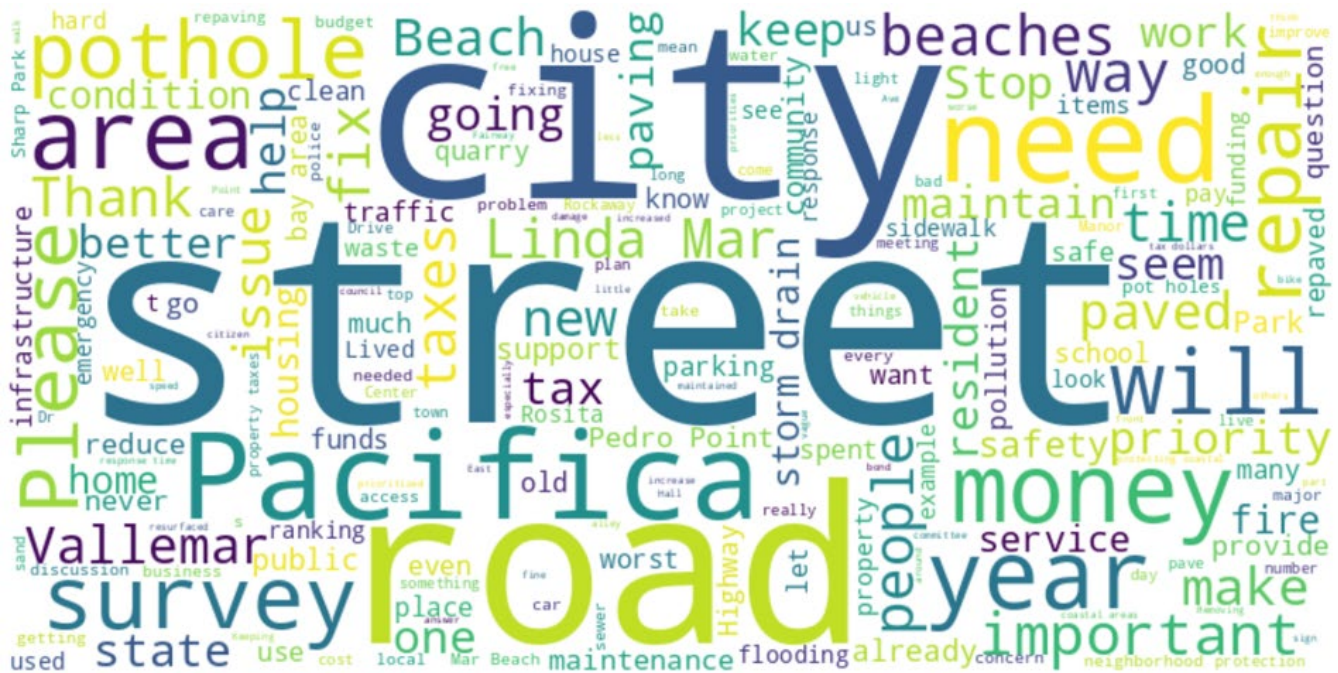
FIGURE 2: WORD CLOUD OF "COMMENTS/QUESTIONS" RESPONSES

These themes align with the issues identified in the priority rankings and other priorities, emphasizing infrastructure maintenance, efficient use of resources, and transparent communication.