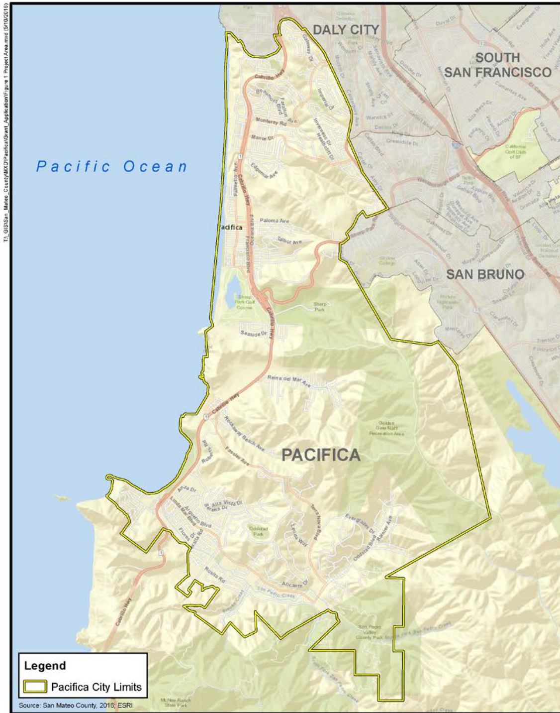
Figure 1 – Project Area Map